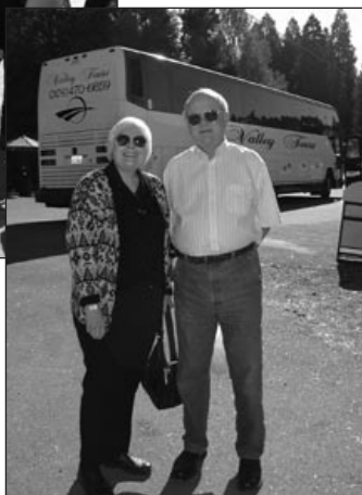
Retirees on Bus Trip to Apple Hill